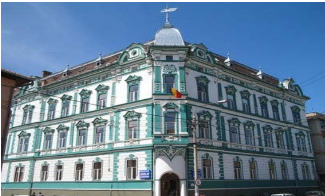
Registration office at: "Lucian Blaga" University of Sibiu, Faculty of Sciences.

PARTICIPANTS' REGISTRATION at the "Lucian Blaga" University of Sibiu, Faculty of Sciences, ground floor, Council Room. Address: 5-7 Ion Rațiu Street, Sibiu, tel. 0731013045, 0722604338, ad.banaduc@yahoo.com, angela.banaduc@ulbsibiu.ro